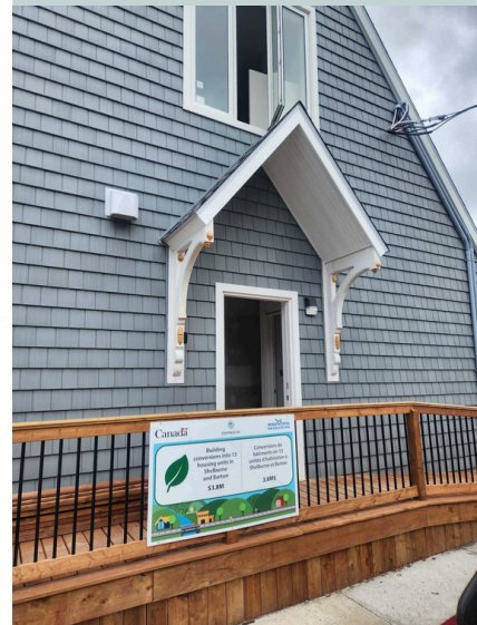
Heritage Hall (above) and Barton School (below)