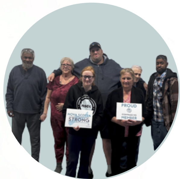
Barton School Neighbourhood Members

Construction at the Barton School is complete. Residents took part in an in-person orientation in their common space. This session was interactive, and members shared excitement about taking part in decision-making and building their community.