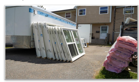
Spanish Bay home during construction

The construction has begun at Topshee and Spanish Bay to complete renovations approved under the 2020 CHIRP offered through Housing NS. The Network is providing oversight for these projects and IRC is completing the project management. The construction on one building has been complete at Spanish Bay.