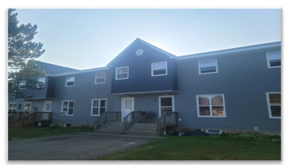
First complete exterior of Spanish Bay